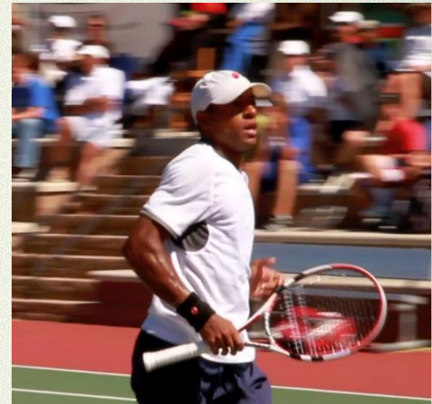
Nick Monroe 2009 Colorado State Open champion and career high #48 ATP Doubles in the world, and 3 ATP doubles titles.