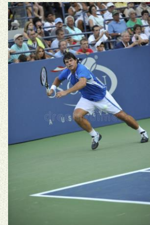
Left- Taylor Dent, 2011 Colorado State Open Doubles Champion, and former ATP #21 in the world