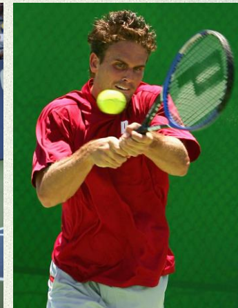
Right- Jan-Michael Gambill, former ATP #14 in the world and runner-up at 2011 Colorado State Open