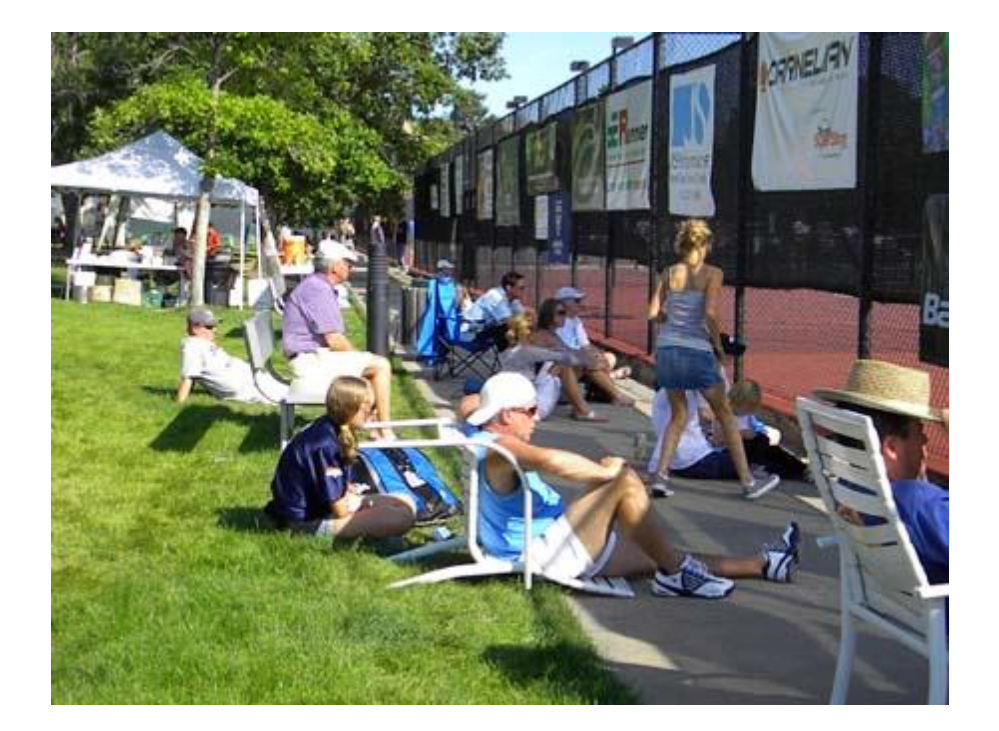
Banners are prominently displayed all year, providing great exposure and recognizing your business as a support of tennis in Denver.

Your company's banner (banner provided by sponsor) displayed prominently within the Gates Tennis Center facility for The Colorado State Open, September 16<sup>th</sup> – September 25<sup>th</sup>. With over 750 individual Colorado State Tournament Competitors and 125,000 Gates visitors annually, this is a fantastic way for your company to gain exposure in the tennis market. Banners are recommended 3x5 or 4x6 in size.